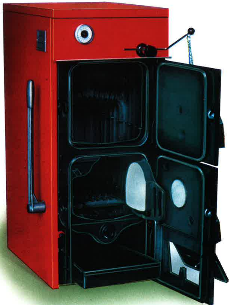
Boiler shown with optional shaker grates.

Both ashpan and ashpit are extra large to handle the high volumes of ash produced by the coal fire. For the highest efficiency, water-cooled fixed grates are an integral part of each intermediate boiler section. These wet grates extract additional heat from the burning coal,