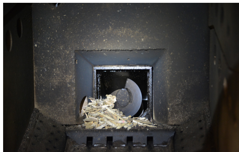
Feeding Chips for the First Time