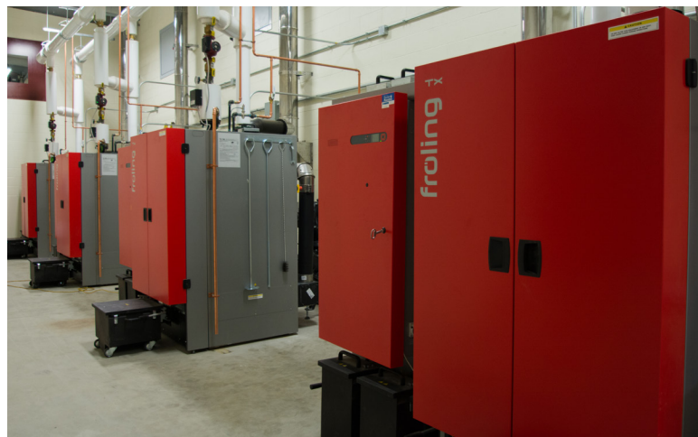
Four Fröling TX 150 boilers