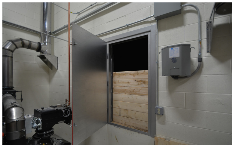
View of Bunker Access Door